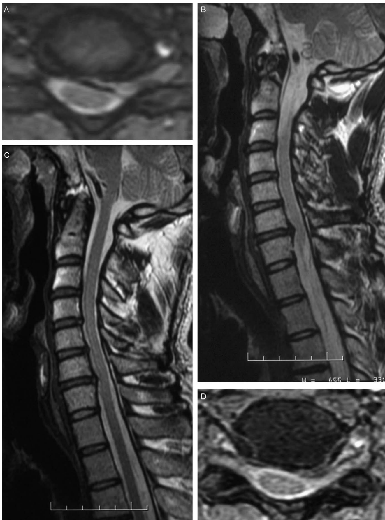
Fig. 3 A T 2 -weighted cervical axial MRI showing soft disc herniation on the left side. B T 2 -weighted cervical sagittal MRI showing soft disc herniation on the C5–C6 level. C T 2 -weighted cervical axial MRI, the soft disc herniation has been removed. D T 2 -weighted cervical axial MRI, the soft disc herniation has been removed.